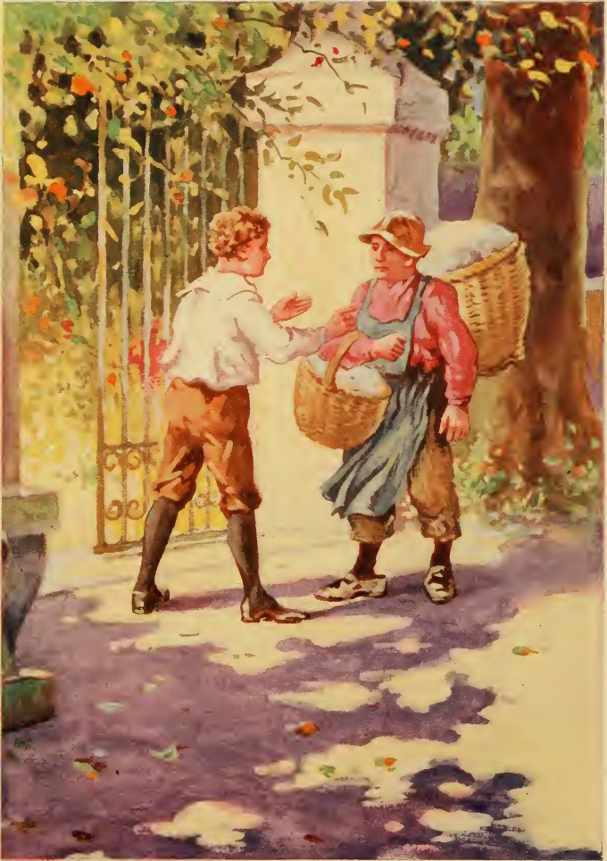
OSCAR WAS AT THE GATE WAITING FOR THE BAKER'S BOY